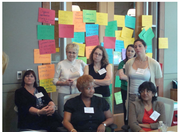
Capital AHEC Making Our Communities Healthier Summit held April 19, 2011.